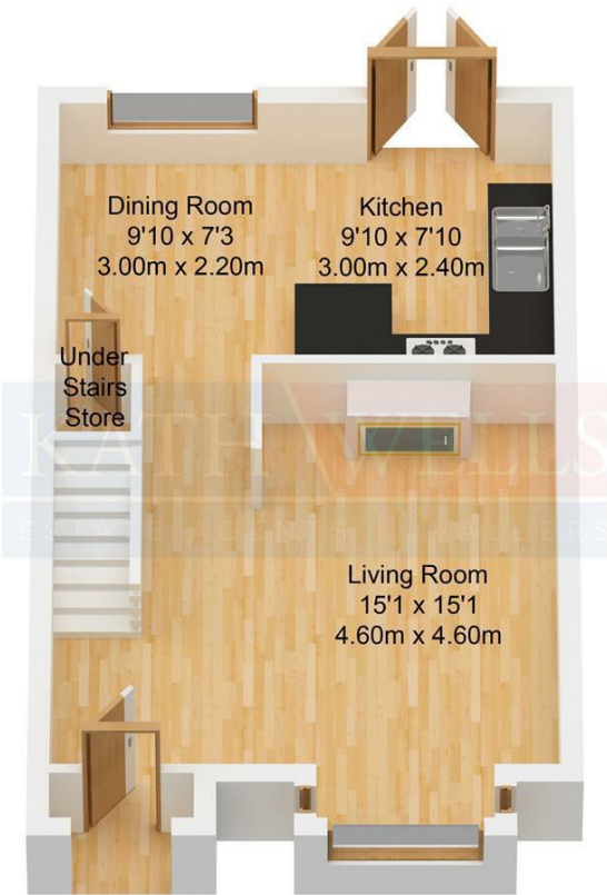
Ground Floor Approx. 37.16 sqm. (399.98 sqft.)